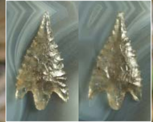
An outstanding example of the base-notched, serrated Shasta variant of the Gunther Barbed arrow point, made of transparent obsidian, found in Modoc County of northern California, in the 1960's by Pat Welch.